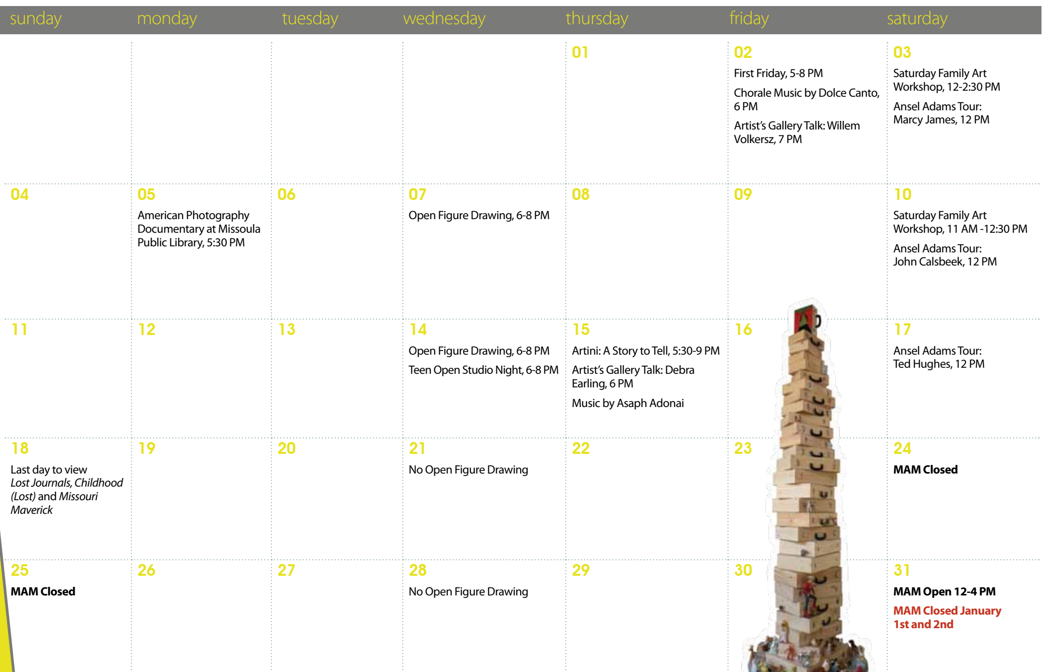
▲ Willem Volkersz, Childhood (Lost) , mixed media.