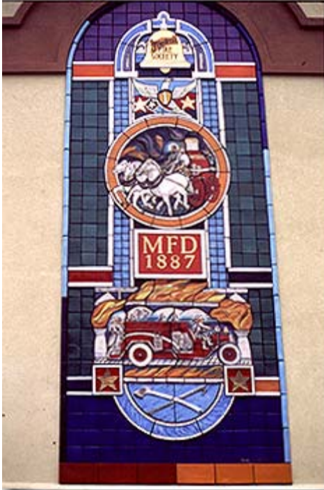
Missoula Fire Station Panel http://www.rudyautio.com/