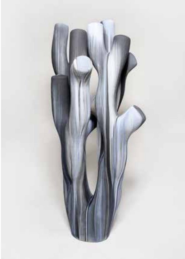
Trey Hill, High Water , Ceramic and Underglaze. ▲