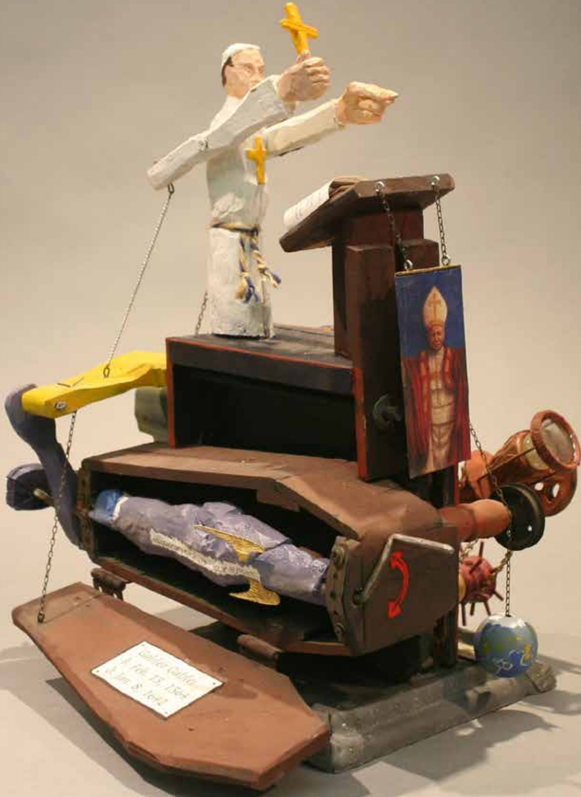
Gallows 17th-18th Century 17th-18th Century